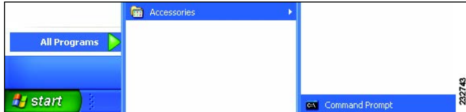
Figure 1 Start > All Programs > Accessories > Command Prompt